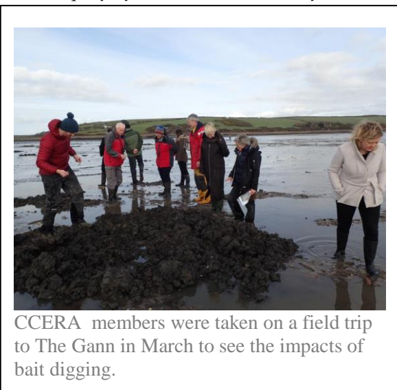
CCERA members were taken on a field trip to The Gann in March to see the impacts of bait digging.

The inquiry into the management of Marine Protected Areas (MPAs) in Wales was seen to be a pivotal study, and one that the RAG felt it very important to input into. As well as providing significant written evidence, the RAG also hosted a visit by the committee to Pembrokeshire in March where a presentation on the work of the RAG was given and a field visit organised to The Gann Flats, Dale. Following this, the SAC Officer was called to give oral evidence at the Senedd. The response to the inquiry by Welsh Government and further discussions during Plenary in November were all carefully followed. The inquiry took up some considerable time commitment in 2017; it is the hope of the RAG that MPA management across Wales will benefit because of it.